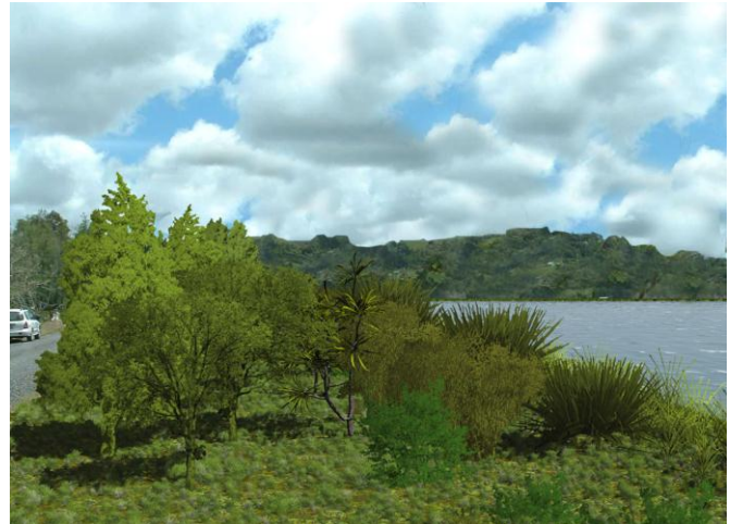
... to this