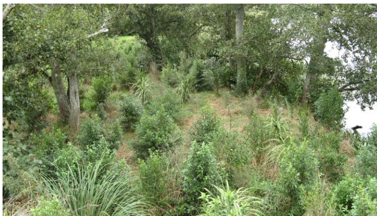
Trees planted in 2006 are growing well.