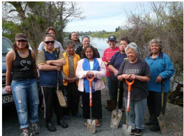
Some of the volunteers who lent a helping hand.