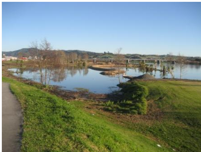
Construction of the wetland area in 2008.

Full planting of trees and bushes has only been undertaken on the isolated island, the rest of the site has just been grassed, to stabilise it until planting is undertaken in spring of 2008.