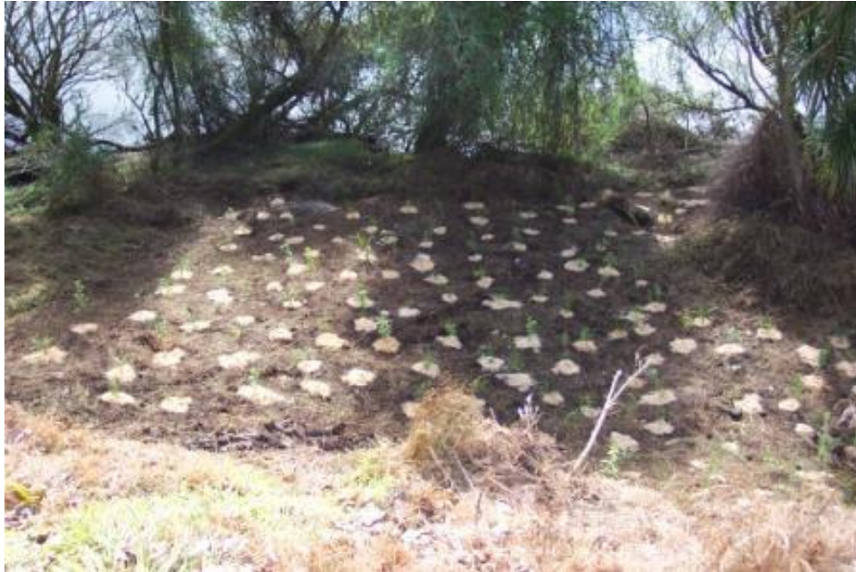
Newly planted specimens.