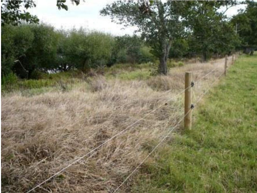
Spraying for site preparation in March 2008.

This site is approximately 1km long and is currently being prepared for planting in late winter 2008. Site preparation has involved engaging a contractor to spray weeds with herbicide. A site management plan has also been prepared and plants ordered in preparation for planting.