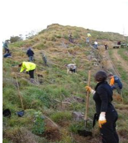
Volunteers working hard.