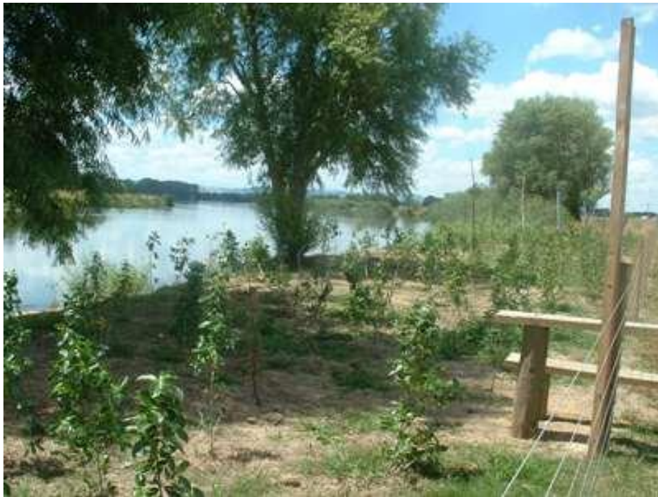
Species thriving along the river bank within the stock-proof fence.

There was some concern that the plants would not survive the Waikato drought and on two occasions a water pump was brought in to water them with water taken from the Waikato River. Thankfully, the plants were hardy specimens and survived well.