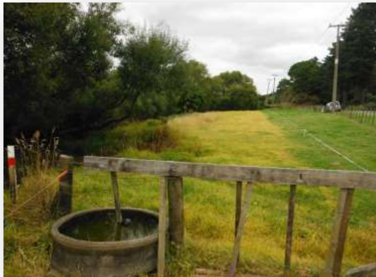
Hakarimata A Extension, site preparation

The successful completion of planting at the Raahui Pookeka A project inside a week was a significant boost. 11,400 plants were planted in 4.5 days, covering a total of 1,100m of riverbank. Other successes over the last 12 months include the securing of more than $230,000 for new projects. They include the