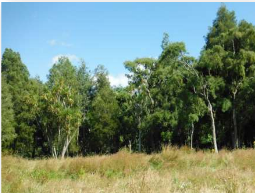
Typical lower Waikato River native vegetation

Waikato RiverCare is the leading riparian restoration charity focussing on preparing, planting and maintaining areas of native plant habitat on the banks of the lower Waikato River and associated catchments, and sourcing funds and support to carry out this work. Sound science, cultural understanding, sustainability and a cooperative approach is an important part of the group's focus.