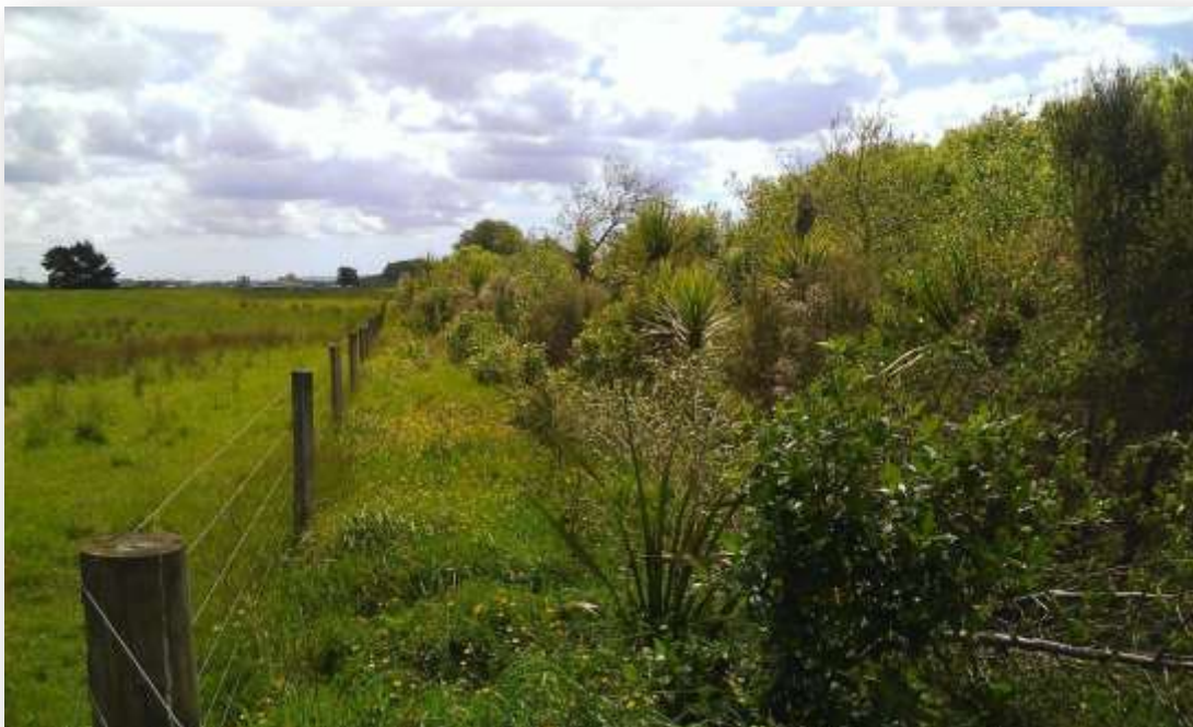
Te Kokiri; alder control