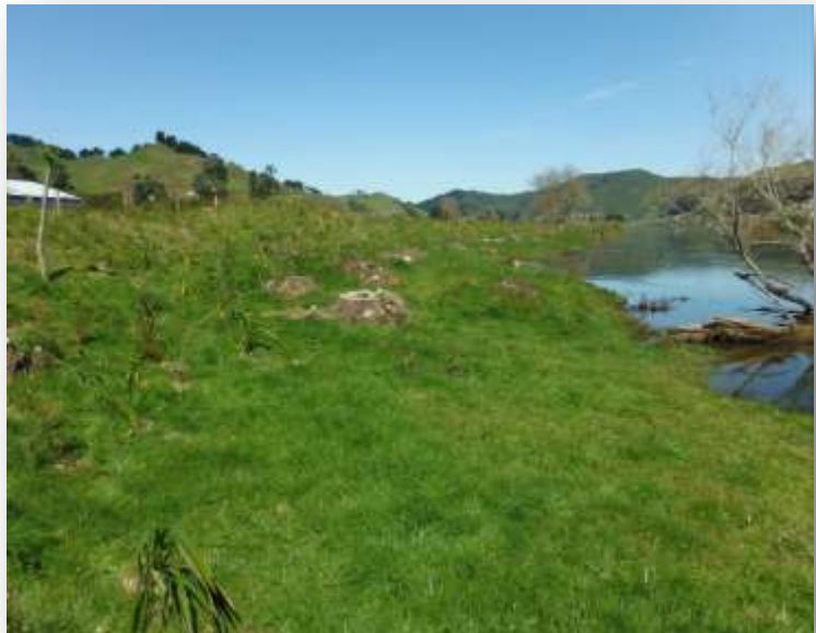
Last day of project planting at Raahui Pookeka

Our media presence has increased significantly, with a revamped logo and website featuring regular updates, a number of positive newspaper articles and even some television coverage of our work along the riverbank in Huntly.