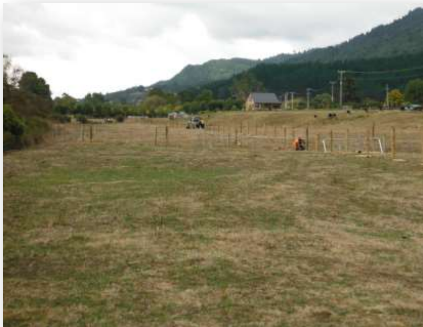
The fence goes up at Hakarimata E