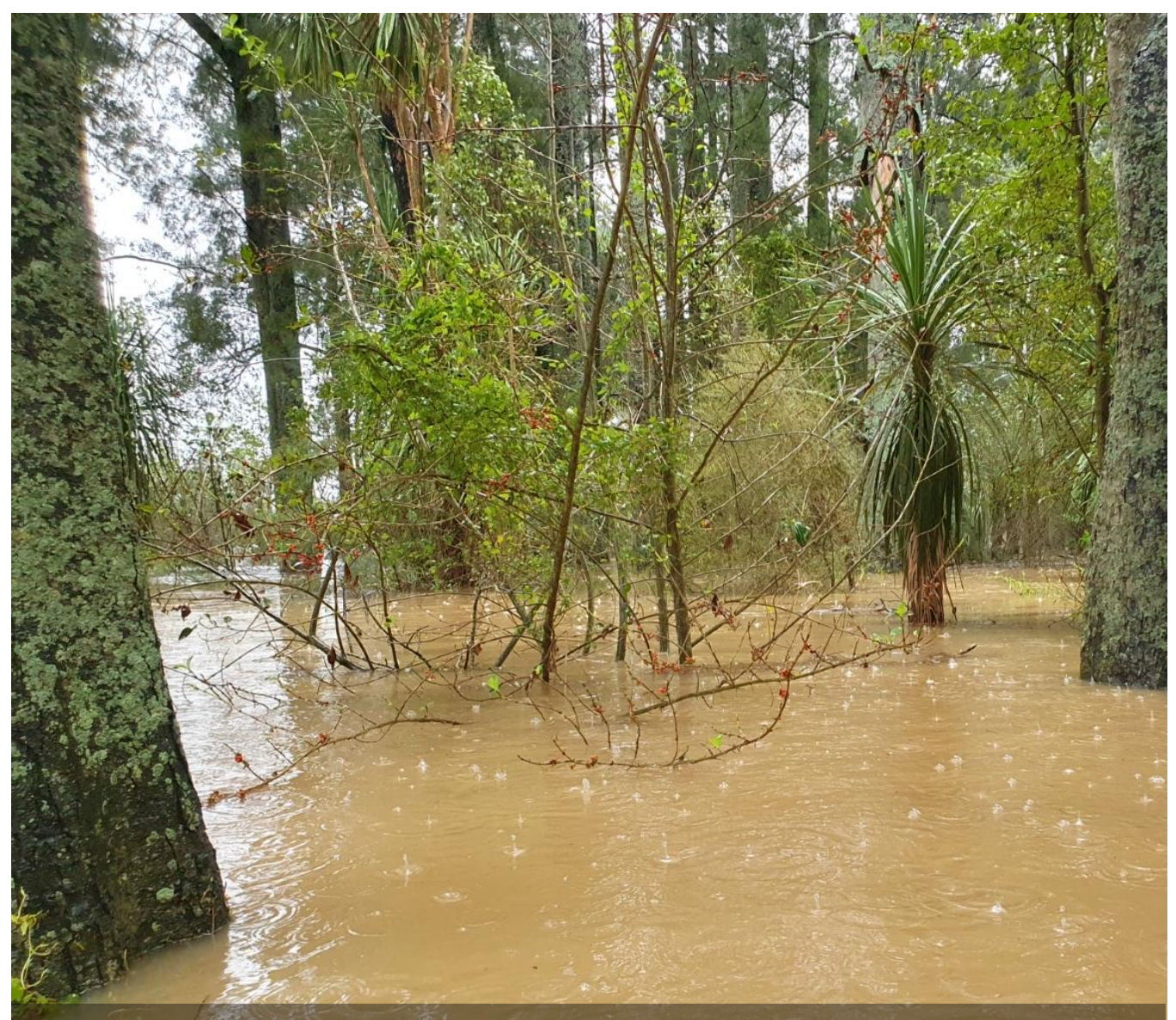
Summer Cyclone's Hale and Gabrielle caused significant damage to several RiverCare projects, particularly those located in the Huntly/Te Kauwhata area. Pictured: The Mangawara catchment set new summer flooding records.