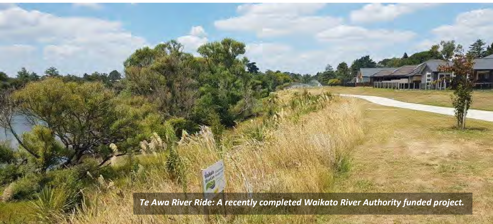
Te Awa River Ride: A recently completed Waikato River Authority funded project.